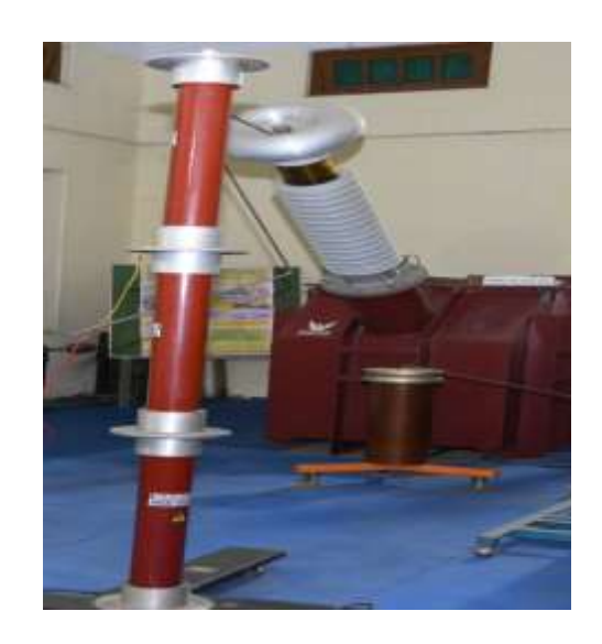
AC Dielectric Testing Transformer, 250 kV, 160 mA, 40 kVA, Phenix Technology, USA