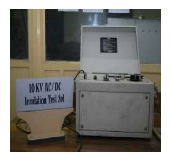
Insulation test set for transformer oil, Neo-Teletronics Calcutta