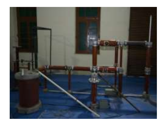
250 kV, 2-stage, Impulse Voltage Generator, WSTest System, Bangalore