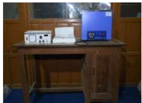
Thermal Conductivity Meter for liquid dielectrics