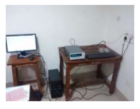
Electrometer (6715B), Keithley