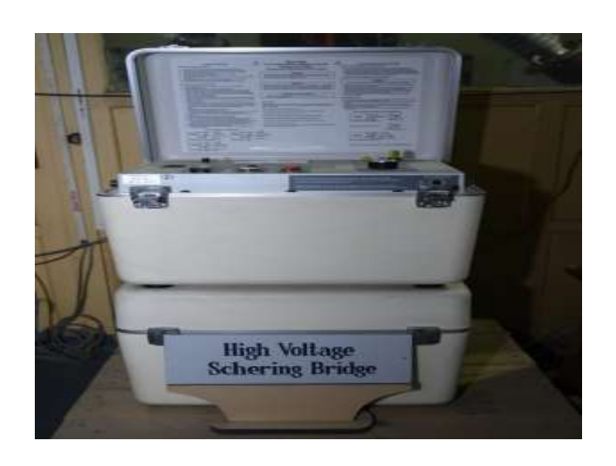
12kV Insulation Test set, Megger