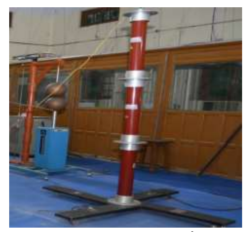
25 Cm Sphere Gap and 250 kV/250V and R-C Voltage Divider, Rectifier Electronics, New Delhi