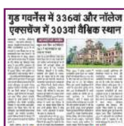
IIT BHU ranks 336th in QS World Ranking Sustainability 2024