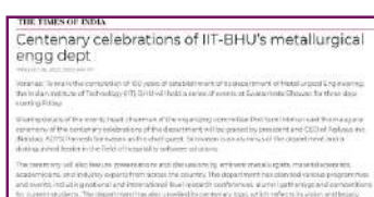
IIT (BHU) successfully conducts METCENT 2023.