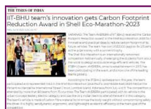
Team AVERERA at the Shell Eco-Marathon 2023