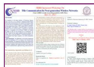
SERB sponsored workshop on THz Communication for Next-generation Wireless Networks