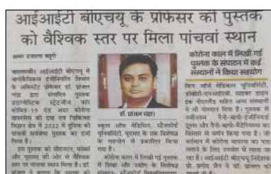
IIT (BHU) professor's edited book rated 5th globally