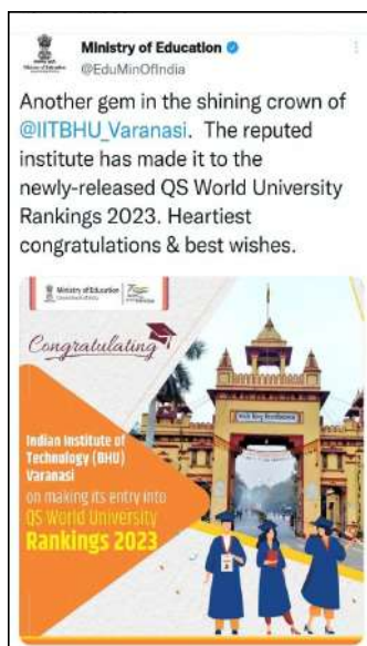
IIT (BHU) enters the QS World University Ranking 2023