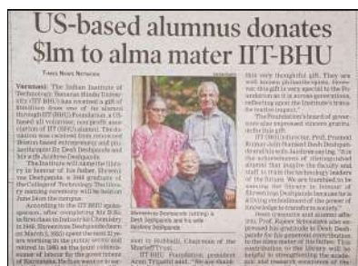
US-based alumnus donates $1M to alma mater