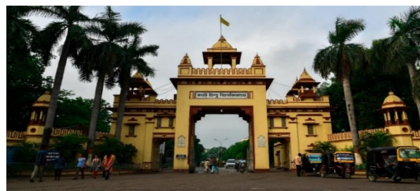
Entrance Gate of Banaras Hindu University Varanasi